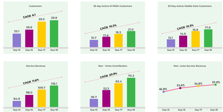
Breakdown of Service Revenue (%)